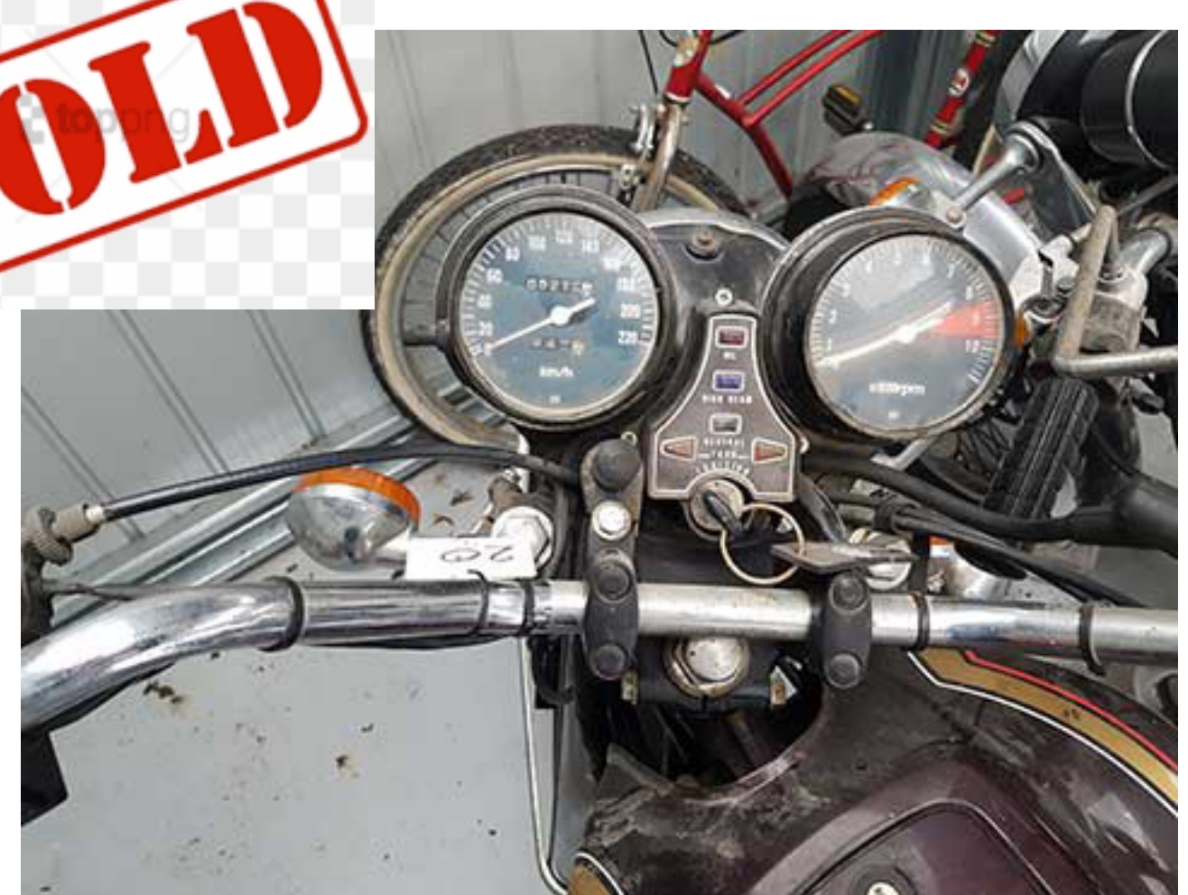
HONDA CB750K4 1974

Rode home from Papakura (South Auckland) Went OK. Then stored for 15 Yrs. Previous owner told me the engine was just overhauled and an 850cc Kit was installed. So this must be 'run in' before any use,