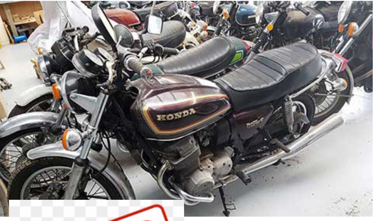
HONDA CB750K4 1974