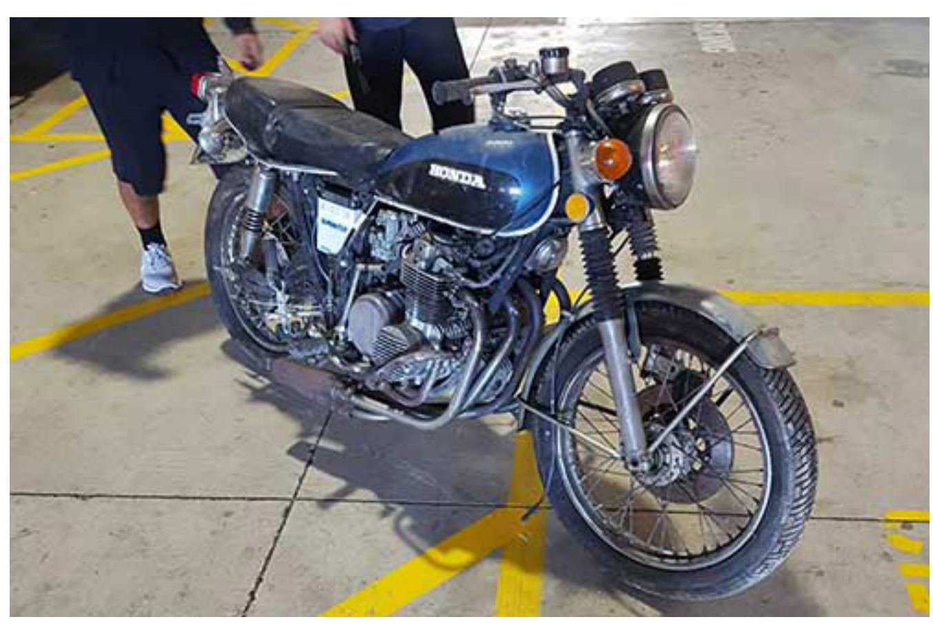
HONDA CB500/4 1974 Never started by me.